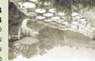
Historical picture of the kaolin mining

The Tretto Plateau is a territory with an ancient mining background where, as far back as the first half of the XVth century, silver, lead, copper and iron were mined . These were small ore deposits that did not allow great quantities of minerals to be mined. Considerable, instead, was the extraction of what was called the "white sand", kaolin . This commodity was extracted from the galleries during winter, and was transported to the surface with rail trolleys: it was then left to decant in wooden buckets. This was followed by a drying process of the "bricks" in characteristic structures known as "casoni" (sheds) that were built from 1800 onwards. At the beginning of the XVth century, mechanised and industrial processing procedures were adopted, even though manual processing stages continued and integrated with a number of processing stages over time. In times gone by, kaolin was used for the washing of yolk wool, while in the famous Doccia Faenza porcelain and as in the famous Doccia