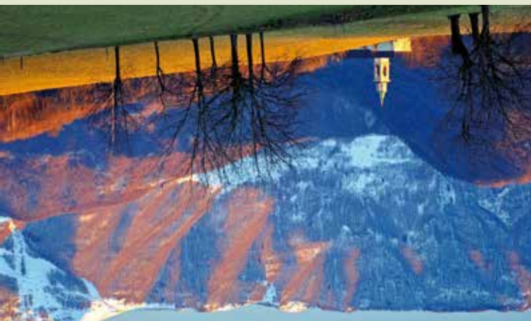
St. Ulderico's bell tower with the Tre Croci Chain in the background

The Tretto Plateau is a territory with an ancient mining background where, as far back as the first half of the XVth century, silver, lead, copper and iron were mined . These were small ore deposits that did not allow great quantities of minerals to be mined. Considerable, instead, was the extraction of what was called the "white sand", kaolin . This commodity was extracted from the galleries during winter, and was transported to the surface with rail trolleys: it was then left to decant in wooden buckets. This was followed by a drying process of the "bricks" in characteristic structures known as "casoni" (sheds) that were built from 1800 onwards. At the beginning of the XVth century, mechanised and industrial processing procedures were adopted, even though manual processing stages continued and integrated with a number of processing stages over time. In times gone by, kaolin was used for the washing of yolk wool, while in the famous Doccia Faenza porcelain and as in the famous Doccia