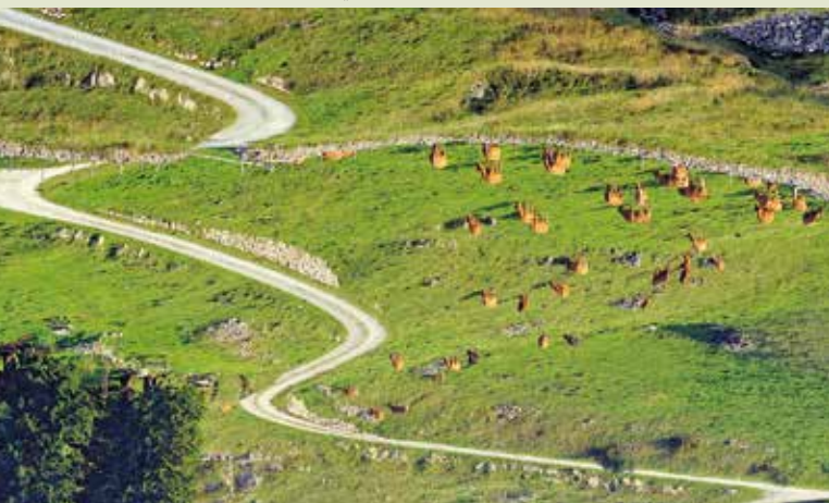
The "Busa" mountain pasture in Novegno

The Novegno massif towers over the Vicenza plains, from lar, into the region known as the Little Dolomites . Towards the north, their range is delimited by steep canyons descending sharply to the Posina valley, while the south watershed has a gentler gradient, with the hilly area of the Tretto Plateau and slopes, tired to a greater extent, rising to the edge of what is perhaps