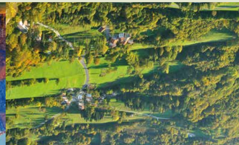
Bosco di Tretto village

From natures path , a naturalistic course marked in the heart of the Plateau, down to routes that unfold between the neighbourhoods' stone houses, through to the highest paths communicating with the alpine pastures, Tretto affords ample possibilities for organising pleasant excursions and relaxing walks, ideal cure-all for both body and mind.