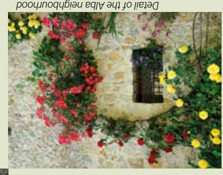
Detail of the Alba neighbourhood

From natures path , a naturalistic course marked in the heart of the Plateau, down to routes that unfold between the neighbourhoods' stone houses, through to the highest paths communicating with the alpine pastures, Tretto affords ample possibilities for organising pleasant excursions and relaxing walks, ideal cure-all for both body and mind.