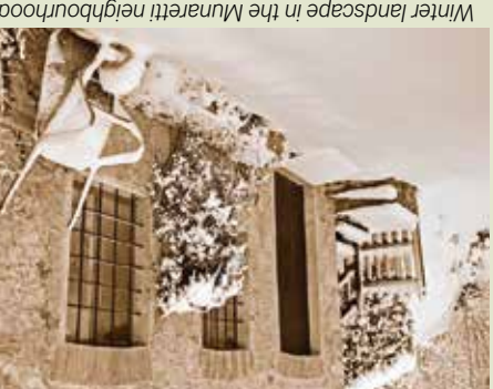
Winter landscape in the Munaretti neighbourhood

The Novegno massif towers over the Vicenza plains, from lar, into the region known as the Little Dolomites . Towards the north, their range is delimited by steep canyons descending sharply to the Posina valley, while the south watershed has a gentler gradient, with the hilly area of the Tretto Plateau and slopes, tired to a greater extent, rising to the edge of what is perhaps