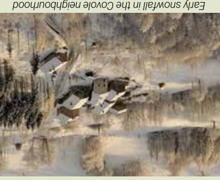
Early snowfall in the Covole neighbourhood

The Tretto Plateau is a territory with an ancient mining background where, as far back as the first half of the XVth century, silver, lead, copper and iron were mined . These were small ore deposits that did not allow great quantities of minerals to be mined. Considerable, instead, was the extraction of what was called the "white sand", kaolin . This commodity was extracted from the galleries during winter, and was transported to the surface with rail trolleys: it was then left to decant in wooden buckets. This was followed by a drying process of the "bricks" in characteristic structures known as "casoni" (sheds) that were built from 1800 onwards. At the beginning of the XVth century, mechanised and industrial processing procedures were adopted, even though manual processing stages continued and integrated with a number of processing stages over time. In times gone by, kaolin was used for the washing of yolk wool, while in the famous Doccia Faenza porcelain and as in the famous Doccia