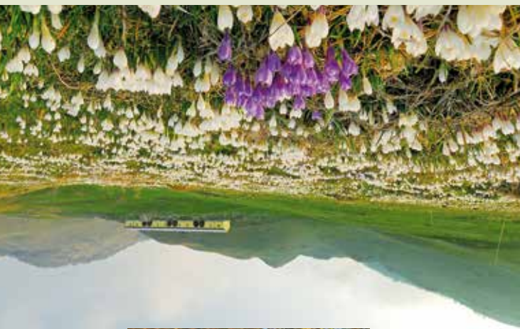
Springtime crocuses blooming around Malga Novegno

The most characteristic feature of the whole complex, called the "Busa" , or grassy hollow where an interesting variety of plant species and wild fauna have found their ideal habitat in the tranquillity of a natural and uncontaminated environment. Higher up, on the Mount Rione spur , 1691 mt. a.s.l., is the Rivon Fort, salvaged evidence of the events that took place here during the First World War. In June 1916, this was the scene of bloody battles between Italian troops and the Stratexpedition regiments, the punishing Austro-Hungarian expedition to overcome the last bastion of Italian defence before being able to expand in the plains. Of those dramatic times, nowadays remain many restored items , evidence of that wartime, making this Mountain a veritable open-air museum: trenches, posts, communication trenches, shelter tunnels and a powder magazine. Every excursion along Novegno's paths and multracks proves to be a touching historical, naturalistic and didactical trail.